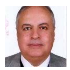
Hassan Abouyoub Ambassador of the Kingdom of Morocco in Italy